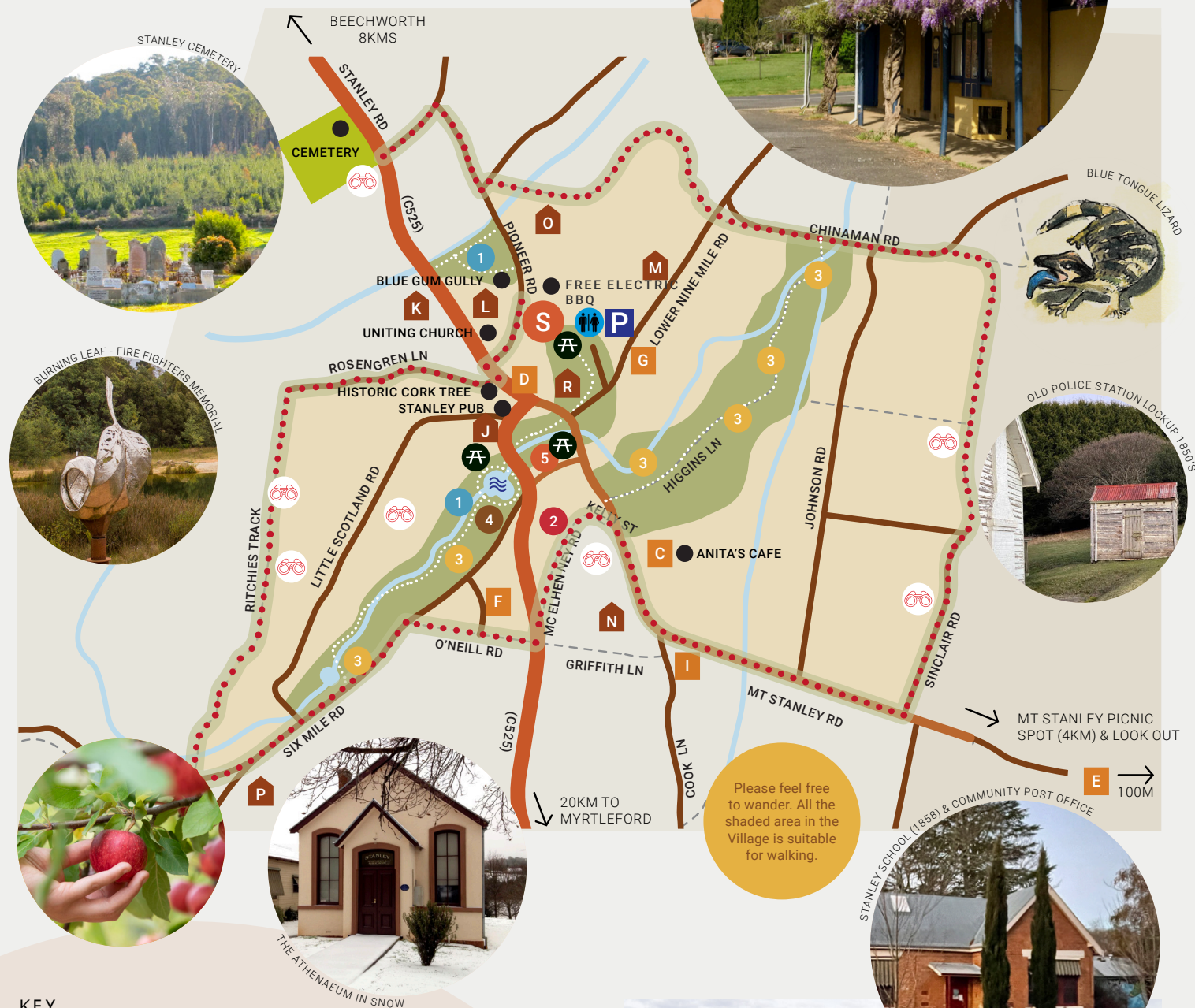
THE ATHENAEUM IN SNOW

Please feel free to wander. All the shaded area in the Village is suitable for walking.