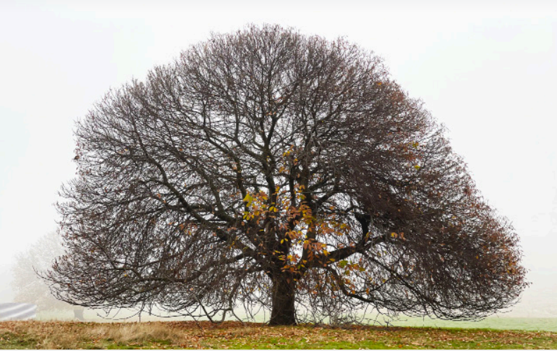
MAGNIFICENT STANLEY CHESTNUT TREE. THIS REGION IS THE MOST INTENSIVE CHESTNUT GROWING AREA IN AUSTRALIA.